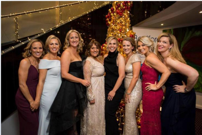
The FOTB Executive Committee with the 2019 Christmas in July Charity Ball Emcee – Edwina Bartholomew

In 2019, the Christmas in July Charity Ball will be held on Friday 5 th July at the Miramare Gardens, Terrey Hills. The goal is to raise another $300,000 for cancer research and we invite you to join us in our mission.