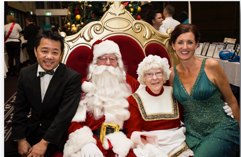
Santa and Mrs Claus post with guests at the 2019 Christmas in July Charity Ball